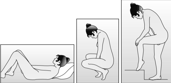
Figures 1a, 1b, and 1c. Positions for NuvaRing® insertion.