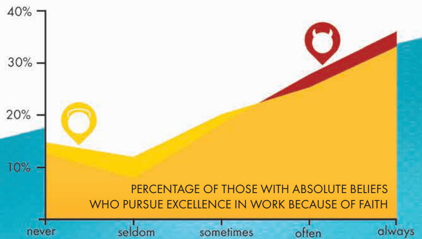
PERCENTAGE OF THOSE WITH ABSOLUTE BELIEFS WHO PURSUE EXCELLENCE IN WORK BECAUSE OF FAITH