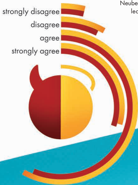
JOB SATISFACTION FOR THOSE WHO ABSOLUTELY BELIEVE IN HEAVEN AND HELL