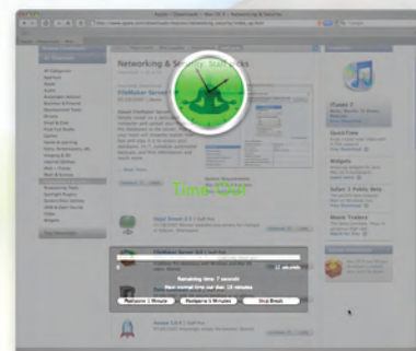
TIME OUT FREE BY DEJAL SYSTEMS, LLC